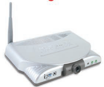
DVC-1100 Wireless Broadband VideoPhone

The remote control included with the DVC-1100 allows you to easily answer incoming videophone calls or initiate new ones. You won't miss a moment with your friends, family and colleagues with the i2eye DVC-1100 Wireless Broadband VideoPhone. Lose the wires, not the connection. Be there real time... anytime.