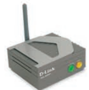
DWL-800AP+ Wireless Range Extender