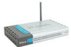
DI-614+ 4-Port Broadband Router

Other D-Link products that work with the DVC-1100: